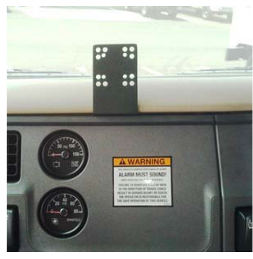
InDash Mount Installed